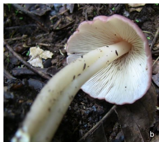
View of basidiocarp